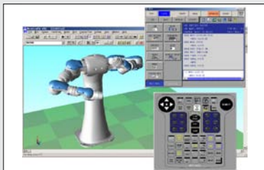
MOTOSIM EG-VRC (OPTION)