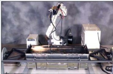
LARGE PART PROCESSING